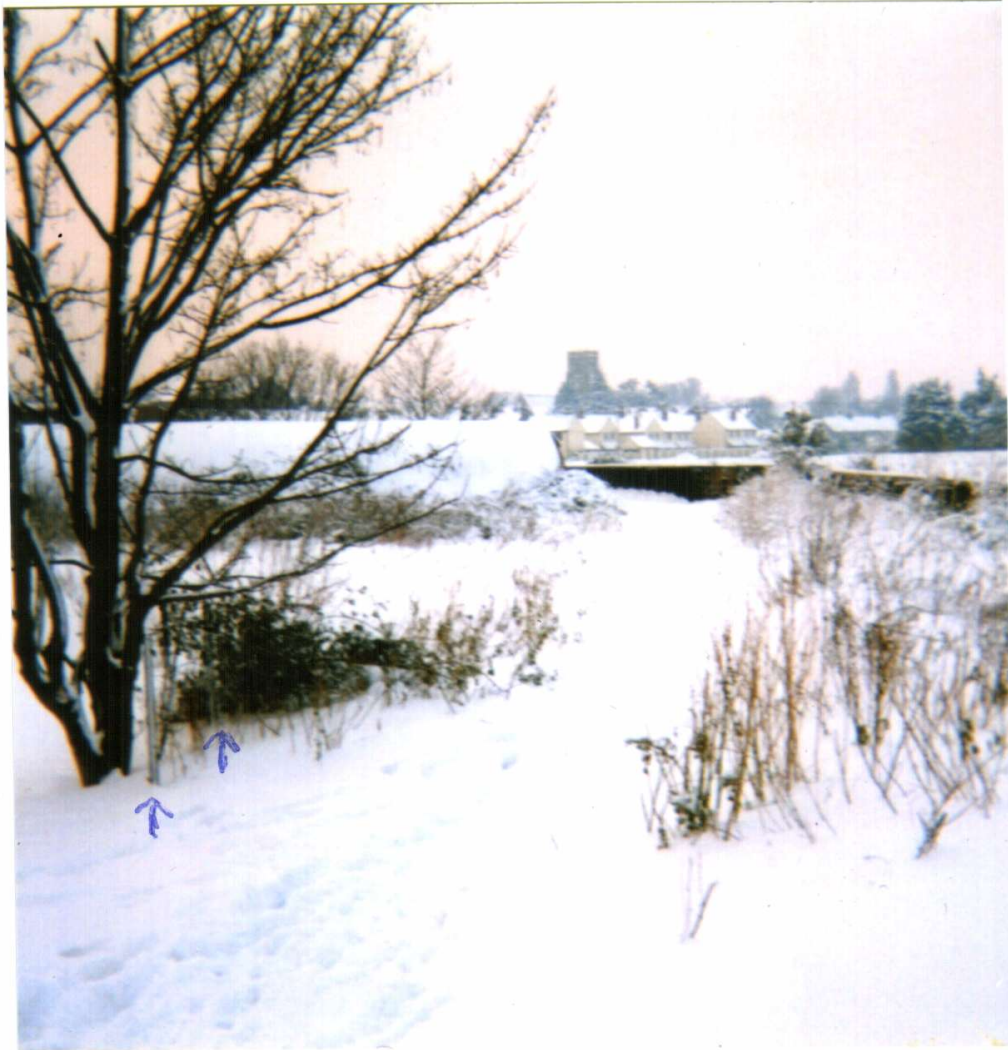
This shows the fence irons going around the tree.